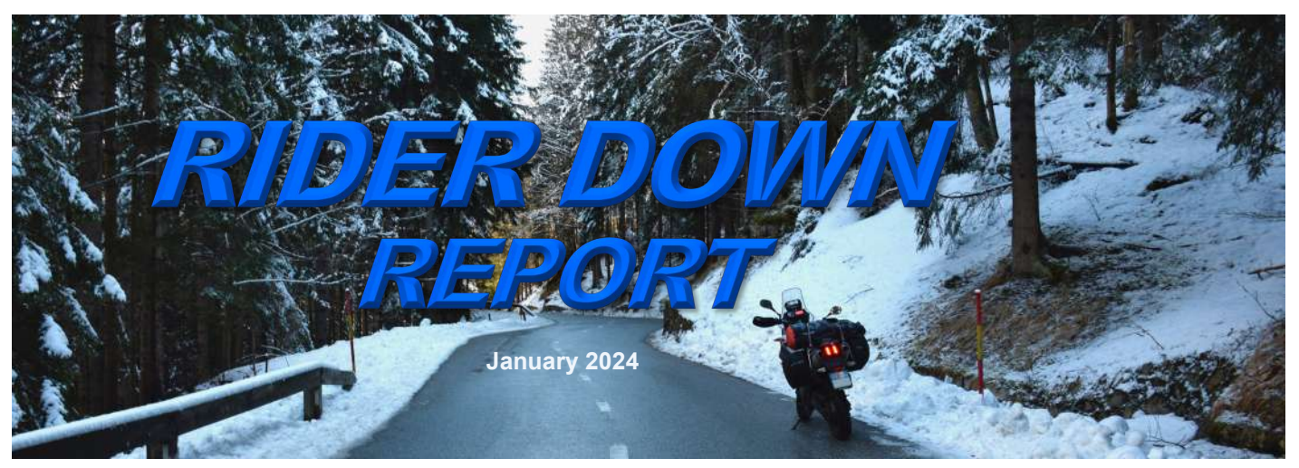
Rider Down is a monthly update of motorcycle crashes that occurred throughout the U.S. Navy and Marine Corps. The data in this publication reflects what was reported during the time period covered.